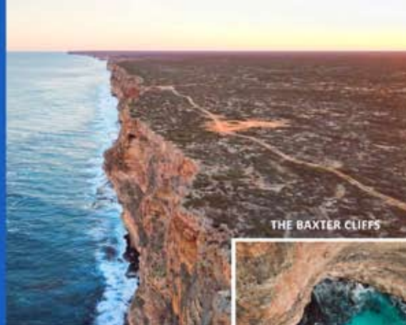
THE BAXTER CLIFFS

The reserve contains the 190 km long and 80m high, Baxter Cliffs – one of Australia's great scenic features and possibly the longest unbroken cliffs in the world. A 4x4 track leads to the cliffs and the Baxter Memorial.