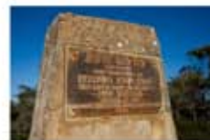
THE BAXTER MEMORIAL